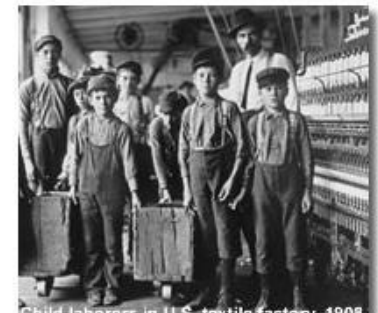
Child laborers in U.S. textile factory, 1908.

You might be surprised to learn that an after-school job would not constitute child labor. Child labor is defined as work done by children under the age of 15, full time, and that can be hazardous to their well being. Child labor often includes not only physical, but also mental and emotional abuse.