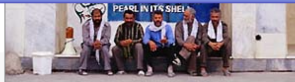
Men on the street, Tehran Travel the World through Poster Art!

Singapore South Korea Sri Lanka Syria Taiwan